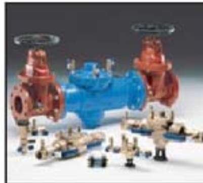
Unleaded Backflow Preventers