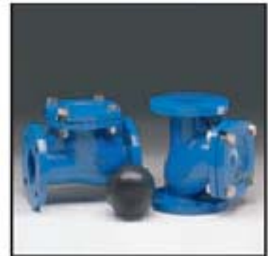
Ball Check Valves