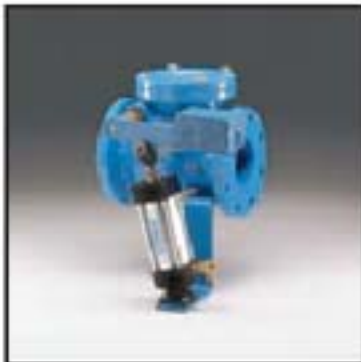
Swing Check Valves