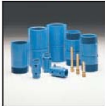
In-Line Check Valves