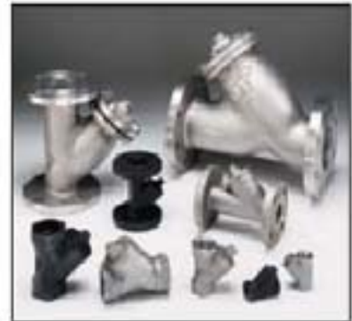
Ward Check Valves